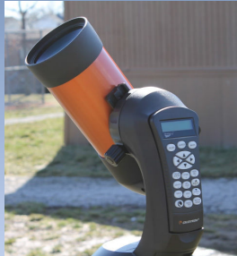
This is our telescope at Derby Ridge. It is a 4" Matsukov-Cassegrain design.

Introduction: We got a telescope and we studied the moon.