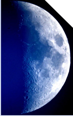
We took the original picture and we clarified it so that we could see the craters better.

Here you can see two craters, Theophilis and Cyrilis which overlap. Cyrilis was made first, because it's not a full circle and its overlapped by Theophilis.