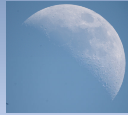
We took this picture in the afternoon at 3:00pm on 3/18/13. This is the moon at first quarter.

Here you can see two craters, Theophilis and Cyrilis which overlap. Cyrilis was made first, because it's not a full circle and its overlapped by Theophilis.